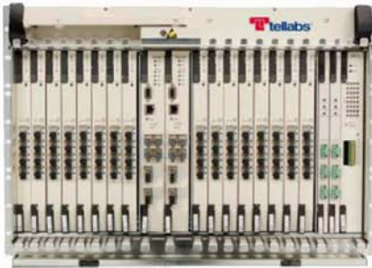
Figure 1: Tellabs 1150 OLT