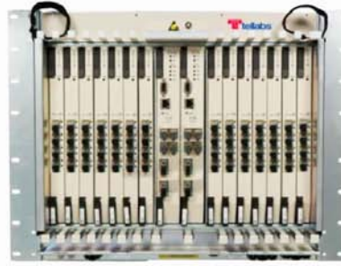
Figure 2: Tellabs 1150E OLT